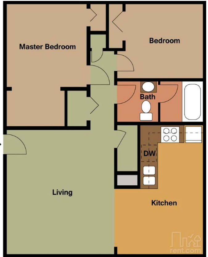
2 BED/1 BATH - 865 Sq. Ft.