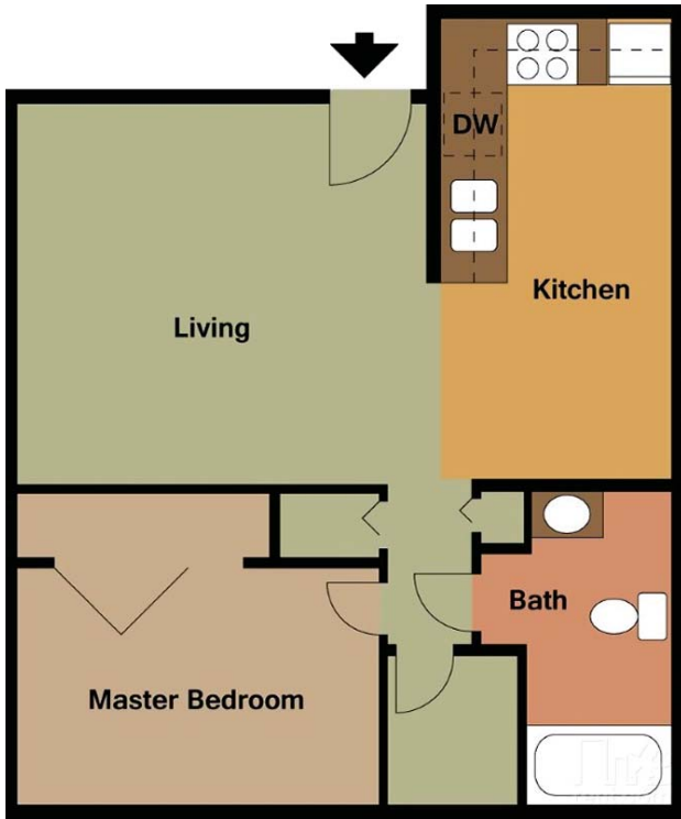
1 BED/1 BATH - 727 Sq. Ft.